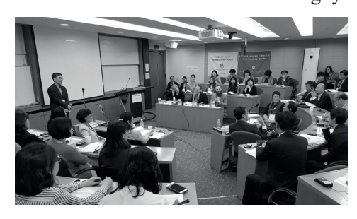
The 4th NEO ER Conference at Sungkyunkwan University Seoul